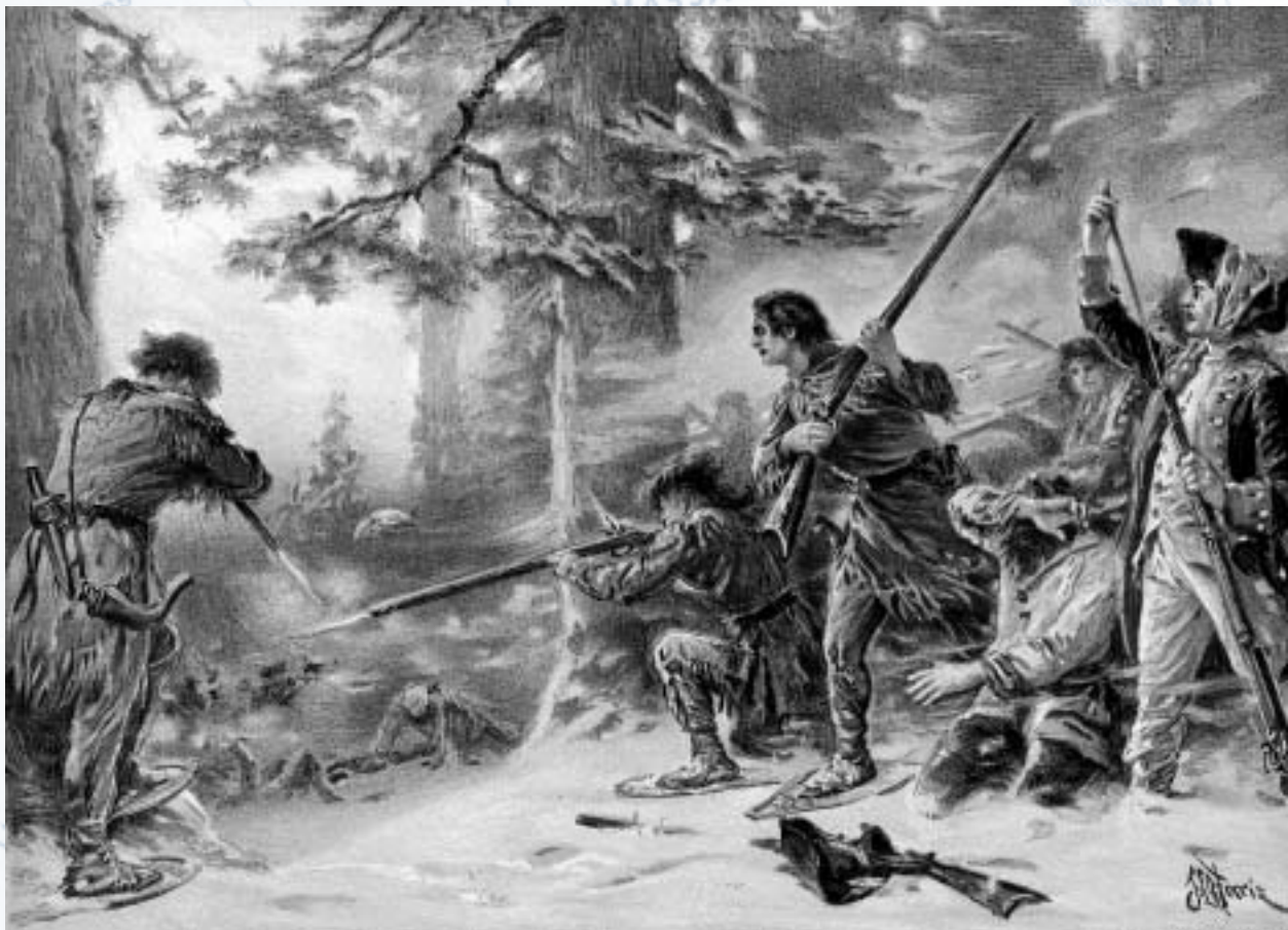
Robert Rogers and his few remaining men make a last stand against the French and Indians.

A bloody and costly battle at Lake George during the French and Indian War gave "Rogers' Rangers" and their legendary commander a place in the colonial history of New York.