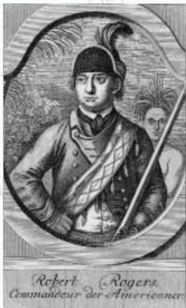
All images of Robert Rogers are derived from the same drawing that was done by an artist in England who had never seen him.