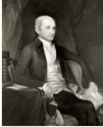
John Jay was the primary author of New York's first constitution, which took nine months to write.